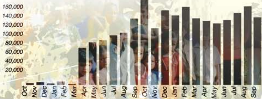
Total Devotions viewed October 2006 - September 2008